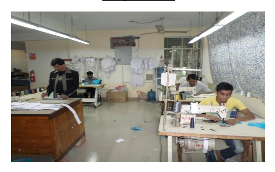
Finishing & Packing